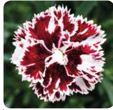
Mendlesham Minx PVR0 (RUSSELL)

Striking dark maroon double flowers which are elegantly edged and splashed with white over a compact grey/green plant with a wonderful fragrance.