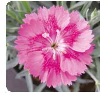
Aztec Star ® PBR syn.WP19 NAM02 • (WHETMAN)

Delicate light magenta single flowers with a dark magenta star shaped eye cover over grey compact foliage. Clove scented.