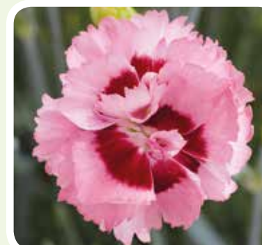
Raspberry Sundae PBR syn.DEVON YOLANDE • (WHETMAN) A mass of blush pink flowers with raspberry eye borne on a grey/green compact plant. Highly fragrant.