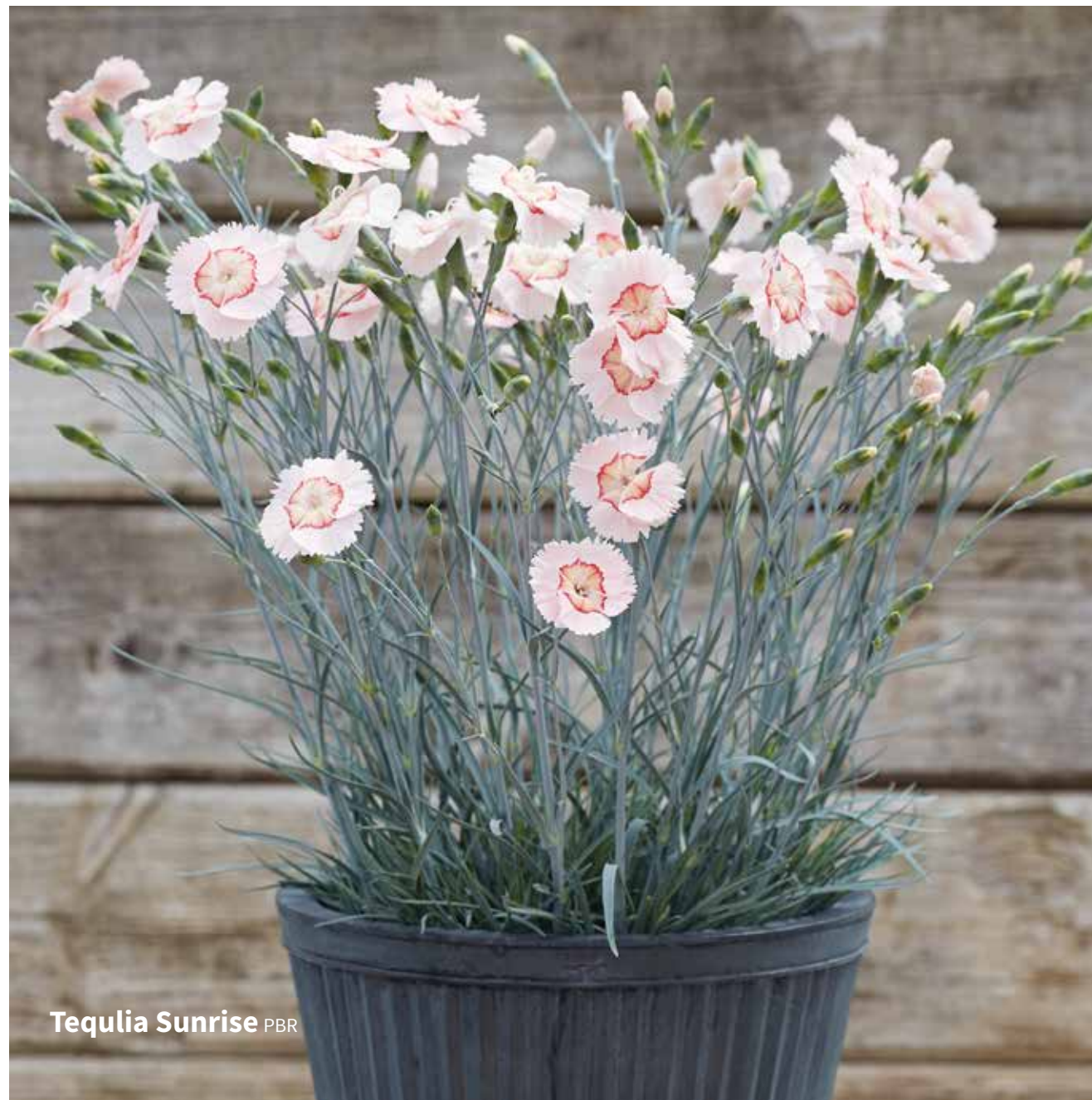
Tequila Sunrise PBR