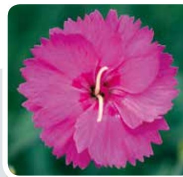
Warden Hybrid (ANON)

Cyclamen purple with semi-double flowers with snowy white stamens. Sweetly perfumed. On a vigorous mound on neat grey foliage.