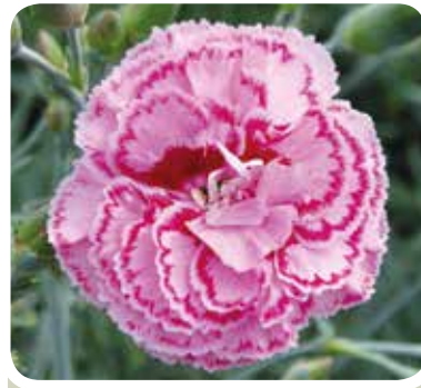
Moulin Rouge PVRO (WHETMAN)

A pretty laced variety with a gorgeous clove perfume and neat spreading grey/green habit. Makes a lovely garden plant for the front of a border or in a planter.