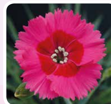
Cosmopolitan PBR syn.WP15 PIE43 • (WHETMAN)

Cerise single flower with redcurrant eye over grey/green foliage. Fragrant. Drought tolerant with long flowering season.