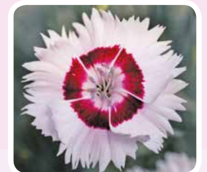
Cherry Daiquiri PBR syn.WP15 PIE42 • (WHETMAN)

Single white flower with blackcurrant eye over grey/green foliage. Highly fragrant. Drought tolerant with long flowering season.