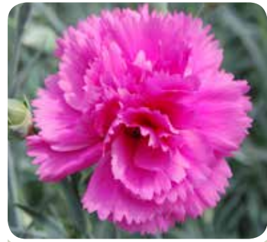
Lily The Pink PBR syn.WP05 IDARE • (WHETMAN)

Double lavender pink borne over grey/green foliage with spicy-sweet perfume. A strong variety which is good for both in the garden or cut flowers.