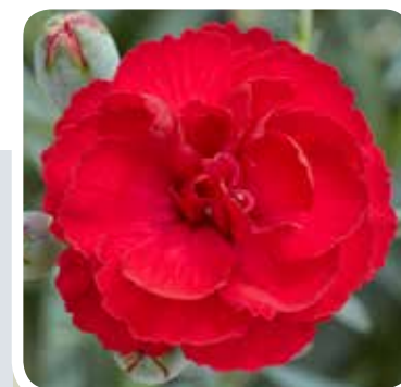
Rebekah PBR syn.WP09 MAR05 • (WHETMAN)

Fully double crimson blooms on a well balanced plant. Free flowering and perfumed.