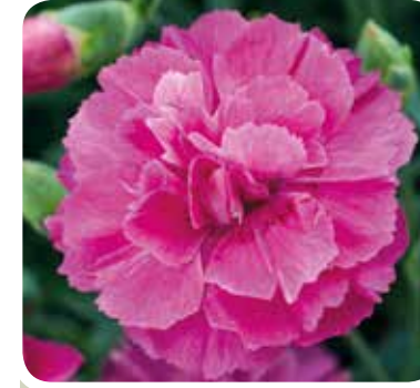
Devon Wizard™ (WHETMAN)

Vibrant cyclamen purple flowers with a ruby red centre over grey/green foliage with wonderful perfume. Makes an excellent garden plant and cut flower.