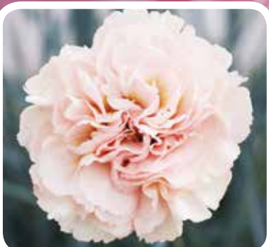
Widcombe Fair (WYATT)

Very subtle champagne pink, fully double blooms and wonderful perfume over grey/green foliage. A great colour for bridal work.