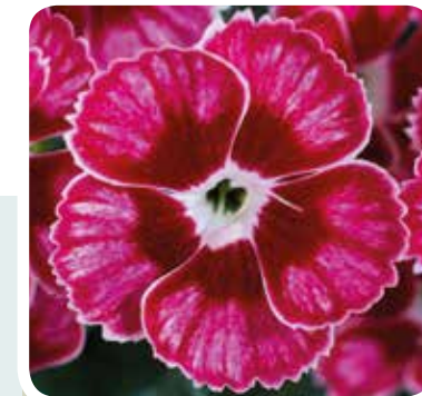
Flutterburst ® PBR syn.WP18 ZOR01 • (WHETMAN)

Delicately patterned single magenta flower with blackcurrant eye and petals fringed with white. Borne over compact grey/green foliage with sweet fragrance.