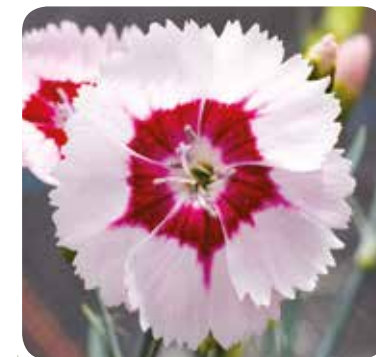
Blushing Star ® PBR syn.WP19 NAM01 • (WHETMAN)

Single pink blush flower turning to white with dark magenta star shaped eye over grey/green foliage. Sweet perfume.