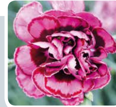
Laced Monarch (ALLWOOD)

Double blooms richly laced with burgundy and lavender borne over grey/green foliage. Excellent sturdy plants that will repeat flower if deadheaded. Calyx splits.