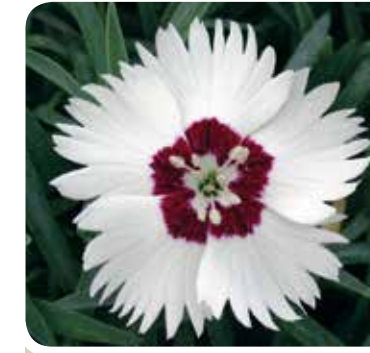
Starry Eyes (WHETMAN)

Deeply fringed white petals with magenta centre, single flower. Crisp grey foliage forming attractive compact mounds.