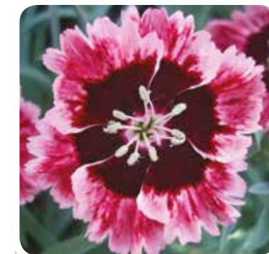
Cherry Burst ® PBR syn.WP19 MOU01 • (WHETMAN)

Single flower with bold maroon eye bleeding into a lighter pink border over compact grey/green foliage. Attractive chocolate buds with sweet perfume.