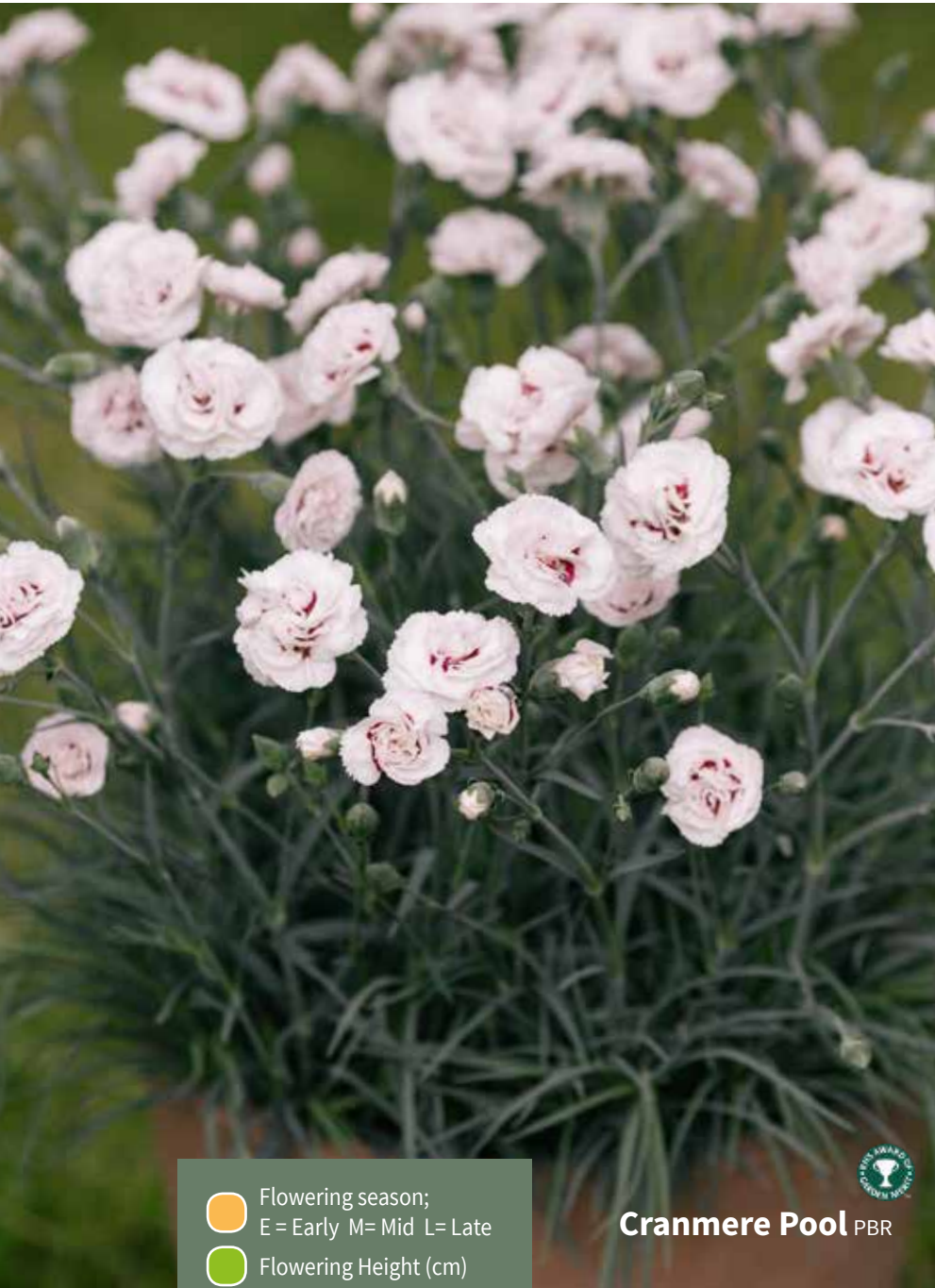
Cranmere Pool PBR