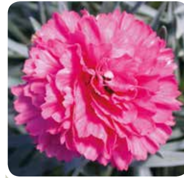
Sherbet PBR syn.WP08 NIK03 • (WHETMAN)

Large magenta fully double flowers on a compact grey/green plant, making a great contribution to any flowering basket or tub.