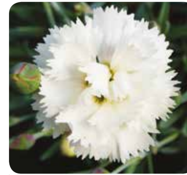
Arctic Star ® PBR syn.DEVON ARCTIC STAR • (WHETMAN)

Icicle white flowers over a compact grey green foliage with sweet fragrance. The early Spring flowers are shorter than the second flush in the following May.