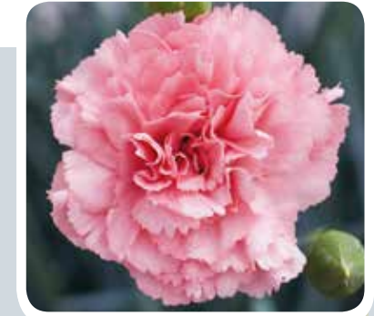
Letitia Wyatt (WYATT)

Gorgeous soft pink double born over grey/green foliage with beautiful fragrance. Makes both a wonderful cut flower and garden plant.