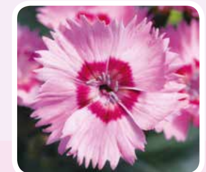
Shirley Temple PBR syn.WP15 PIE44 • (WHETMAN)

Pink single flower with maroon eye over grey/green foliage. Fragrant. Drought tolerant with long flowering season.