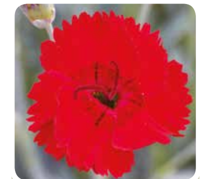
Fire Star ® PBR syn.DEVON XERA • (WHETMAN)

Vivid red fragrant single flowers with a crimson eye borne on a vigorous mound of neat grey/green foliage.