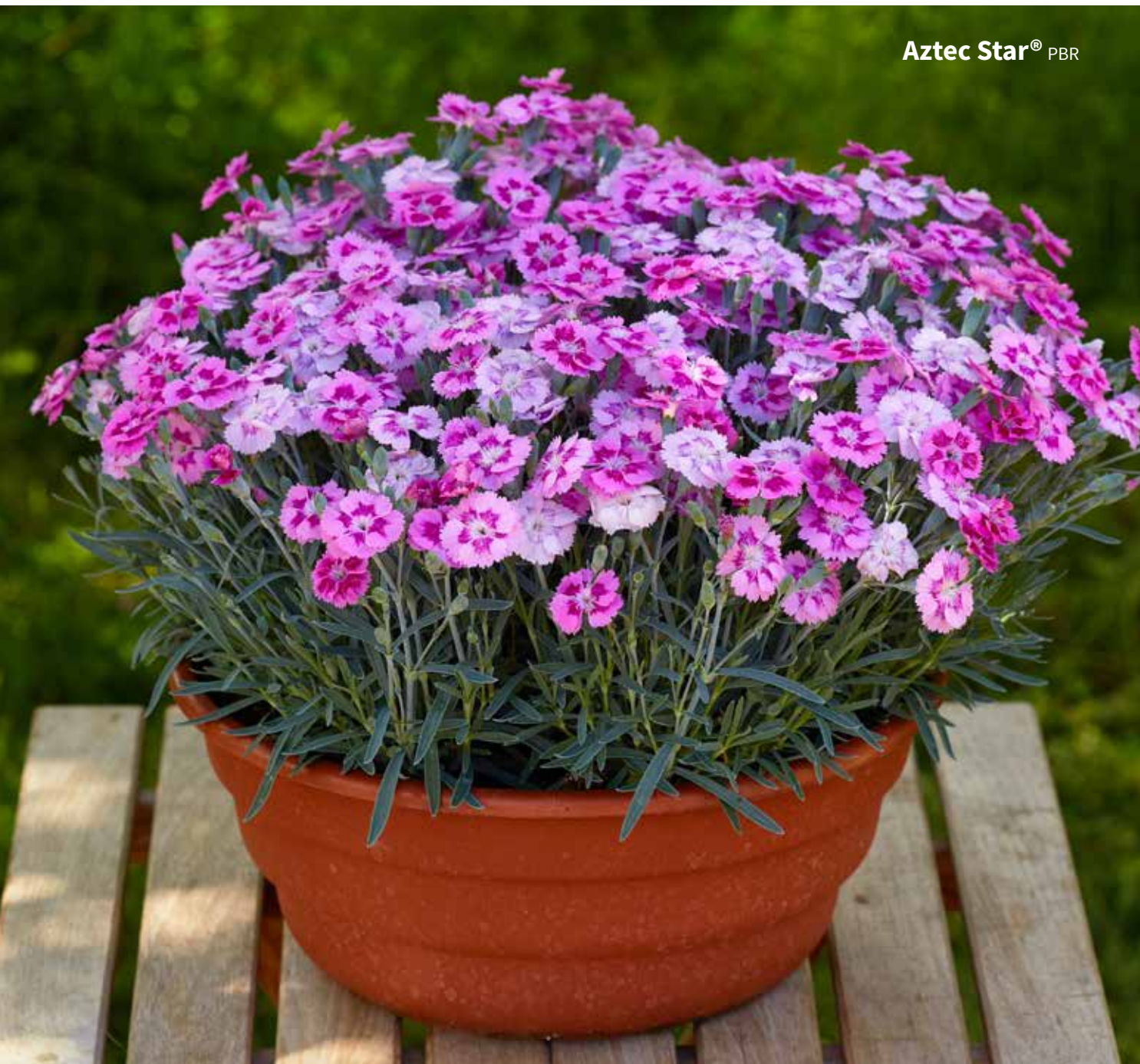
Aztec Star ® PBR