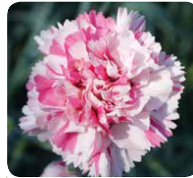
Bailey's Celebration (BAILEY)

A beautiful double flower with pink and white flecks over grey/green foliage with a wonderful fragrance. Ideal for cutting.