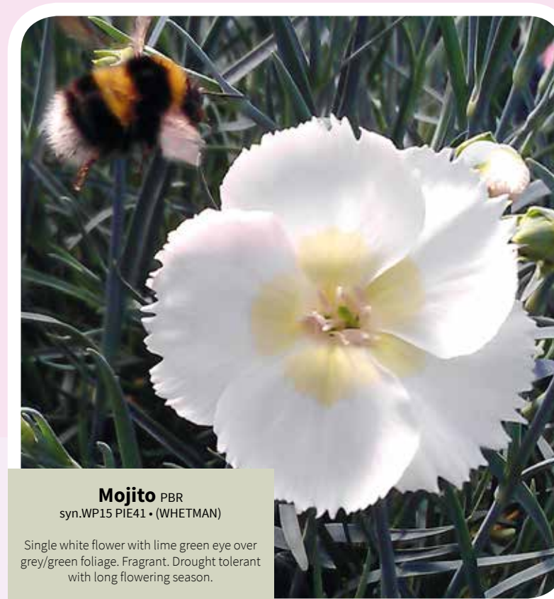
Mojito PBR syn.WP15 PIE41 • (WHETMAN)

Single white flower with lime green eye over grey/green foliage. Fragrant. Drought tolerant with long flowering season.