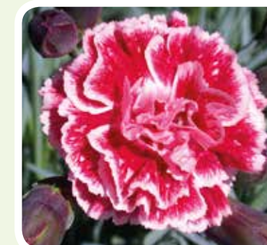
Sugar Plum PBR syn.WP08 IAN04 • (WHETMAN) Wonderful wavy petals of maroon, pink and white. The buds are attractively chocolate coloured. Highly fragrant.