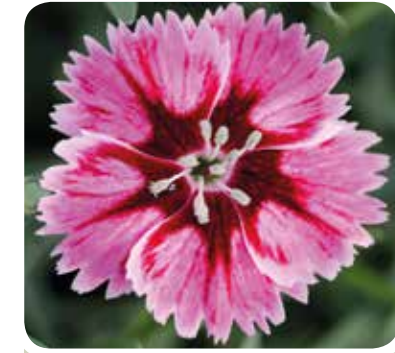
Supernova PBR syn.WP11 TRY04 • (WHETMAN)

Striking single dark pink and white patterned flowers with a maroon eye over compact grey foliage. Fragrant with repeat flowers and ideal for pots or borders.