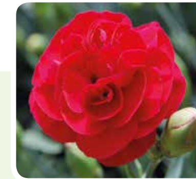
Passion PBR syn.WP PASSION • (WHETMAN) Exquisitely formed velvety red blooms on a balanced plant flowering over a very long period. Highly fragrant.