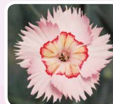
Tequila Sunrise PBR syn.WP15 PIE45 • (WHETMAN)

Peach single flower with red edged apricot eye over grey/green foliage. Fragrant. Drought tolerant with long flowering season.