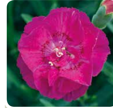
Shooting Star PBR syn.WP04 FLORES • (WHETMAN)

Rich magenta double frilly flowers with ruby freckles in the centre. Forms a spreading mound.