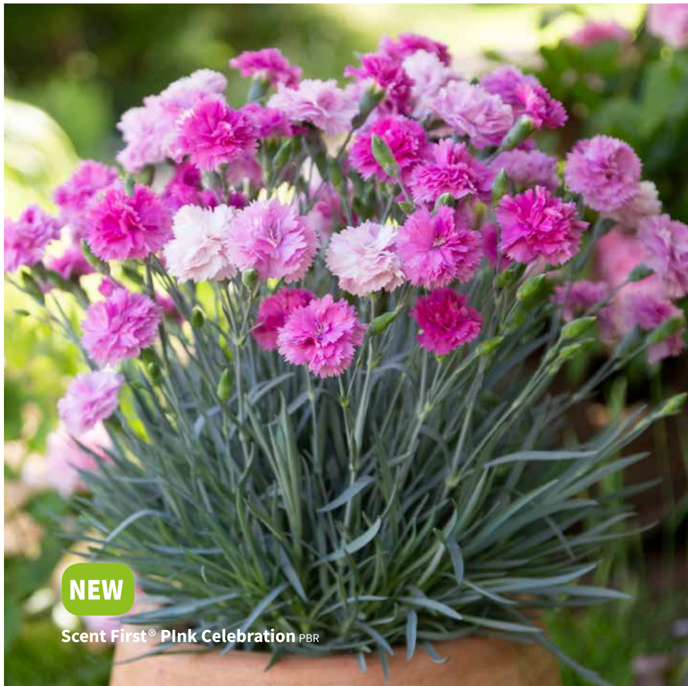
Scent First® Pink Celebration PBR