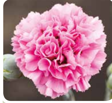
Pink Ruffles PBR syn.WP18 MOW09 • (WHETMAN)

Pink double flower with dark eye over grey/green foliage with spicy sweet fragrance. Favourite with gardeners.