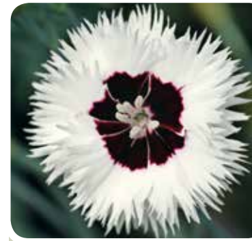
Stargazer PBR syn.WP13 GIL05 • (WHETMAN)

A mass of striking flowers with a very dark, almost black eye forming a neat grey/green mound with wonderful perfume.