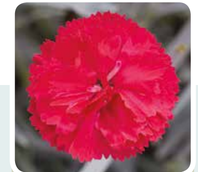
Fusilier ® (BYATT)

Delicate dark red semi-double flowers borne over compact grey/green foliage.