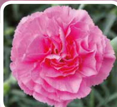
Valda Wyatt (WYATT)

A deep lavender double, making sturdy compact grey/green plants with good quality blooms. A truly excellent garden and cut flower variety.