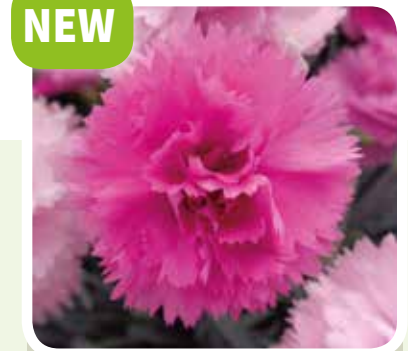
Pink Celebration PBR syn.WP21 DVC01 • (WHETMAN) Profusion of double pink flowers that change colour over time from dark pink to pale pink/white. Highly clove scented, bee friendly and outstanding garden performance.