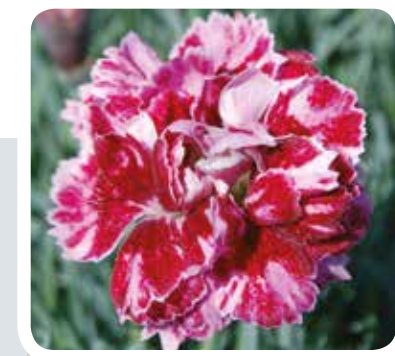
Whatfield Gem (SCHOFIELD)

Rich ruby blossoms dusted with white speckles and soft pink undersides to the petals borne over grey/green foliage.