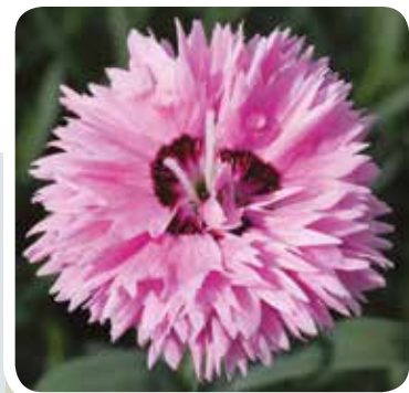
Pop Star PBR syn.WP04 ESTHER • (WHETMAN)

Deeply fringed double lavender blooms with a cherry eye on a compact grey/green foliage.