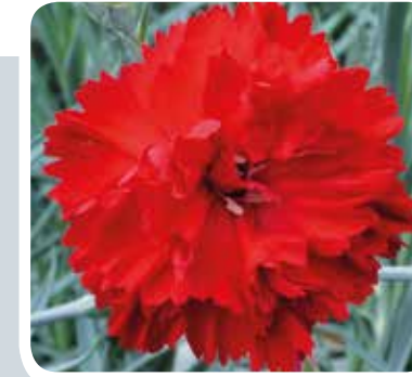
Lady In Red PBR syn.WP04 XANTHE • (WHETMAN)

Semi-double vibrant vermillion very fragrant flowers with arching stems and beautiful grey/green foliage. Great in a basket.