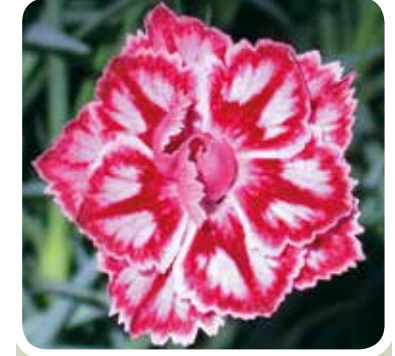
Starburst PBR (WHETMAN)

Delightfully patterned flowers with cherry red and white stripes that look like old fashioned humbug sweets. A striking garden favourite. Very fragrant.