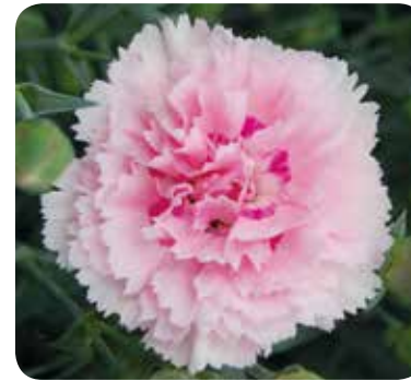
Candy Floss PBR syn.DEVON FLAVIA • (WHETMAN) Sugar pink flowers with a subtle rose pink eye on strong stems over grey/green foliage. Highly fragrant.