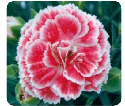
Coral Reef PBR (WHETMAN) A gorgeous mass of deep coral flowers with white picotee edges over a compact grey/green foliage. Highly fragrant.