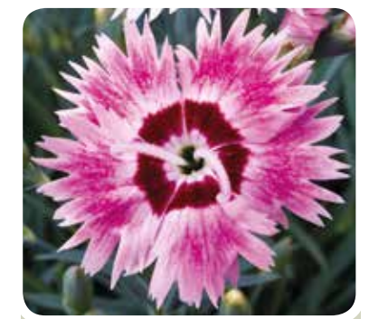
Berry Blush ® PBR syn.WP21 MIN01 • (WHETMAN)

This beautiful modern pink has striking large single two tone flowers with a berry eye, deep fimbriation and an intricate pattern. It has an abundance of scented flowers over grey/green foliage and repeat flowers. Ideal for pots or borders.