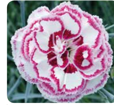
Gran's Favourite (UNDERWOOD)

White flowers laced with beautiful currant red edges, making sturdy grey/green compact plants. Deservedly popular garden plant with a wonderful fragrance.