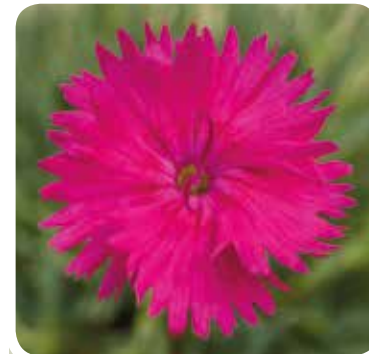
Neon Star PBR (WHETMAN)

Amazing iridescent cerise single flowers borne on a vigorous mound of neat grey foliage. Very hardy.