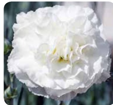
Bridal Star PBR syn.WP18 CAS06 • (WHETMAN)

Large pure white double flowers with iridescent ruffled petals over a compact grey/green foliage with a clove scented fragrance.