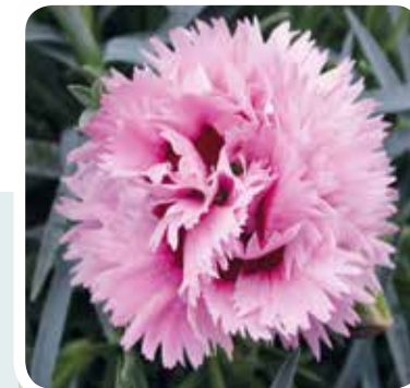
Fizzy ® PBR syn.WP08 VER03 • (WHETMAN)

An early flowering lavender double with blackcurrant eye over a grey/green foliage with a wonderful fragrance.