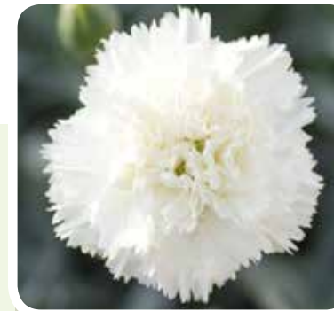
Memories PBR syn.WP11 GWE04 • (WHETMAN) Pure white flowers over compact grey/green foliage with outstanding spicy fragrance. A multi-award winning variety. Highly fragrant.