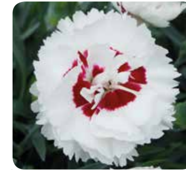
Coconut Sundae PBR syn.WP 05 YVES • (WHETMAN) A mass of white flowers with blackcurrant eye over compact grey/green foliage. Highly fragrant.