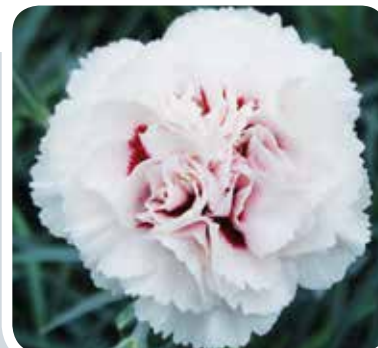
Cranmere Pool (WYATT)

Pure white fully double flowers with magenta eye, over bushy grey/green foliage. Highly fragrant.