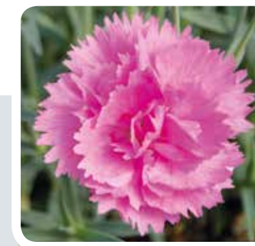
Whatfield Can Can (SCHOFIELD)

Parisian pink frilled double flowers borne over compact grey/green foliage with a sweet perfume. Very hardy.