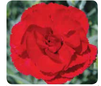
Houndspool Cheryl (WHETMAN)

A currant red semi-double sport of Doris with the same characteristics and easy to grow. Wonderfully fragrant.